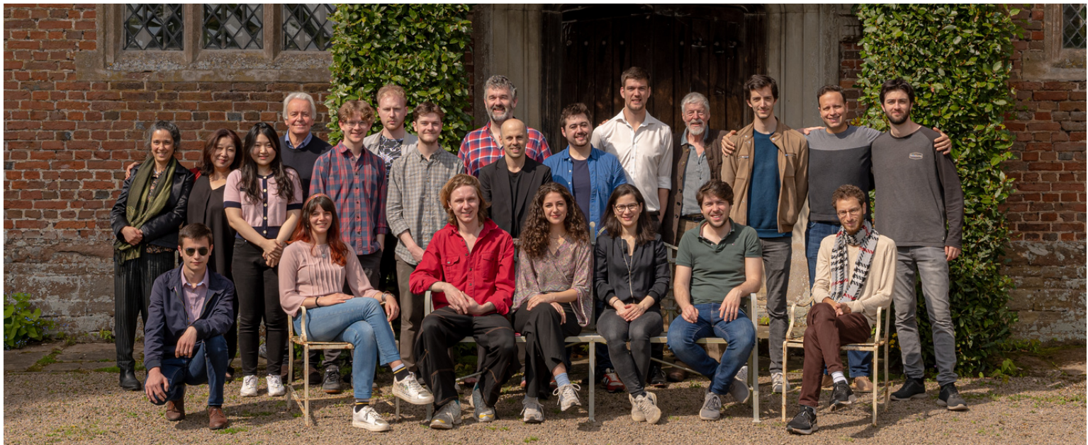
Class of 2023